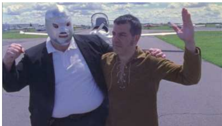
Jesus y El Santo

Vampire Hunter where I screamed -- I mean, screamed -- " SANTO! " at my TV. I'm not so much the type to bark out the names of luchadores enmascarados at consumer electronics devices either, but the sight of a beefy Mexican wrestler in a Burlington Coat Factory sports jacket hopping out of a plane and throwing his arm around our Lord and Savior...? That was it. That's when Jesus Christ: Vampire Hunter bounded over that line from a really great Canadian campfest to pure, uncut genius .