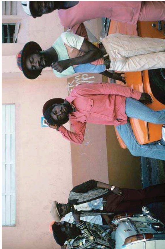
"This was known as 'Vibes' Rest,' was around the corner from Randy's Record Shop. Musicians, singers, and would-be singers would lurk about listening to the newest 45s 9/11, waiting to be called in for a session."

How did Jamaica feel to someone from Andros and New York? Really exotic. An unusual experience.