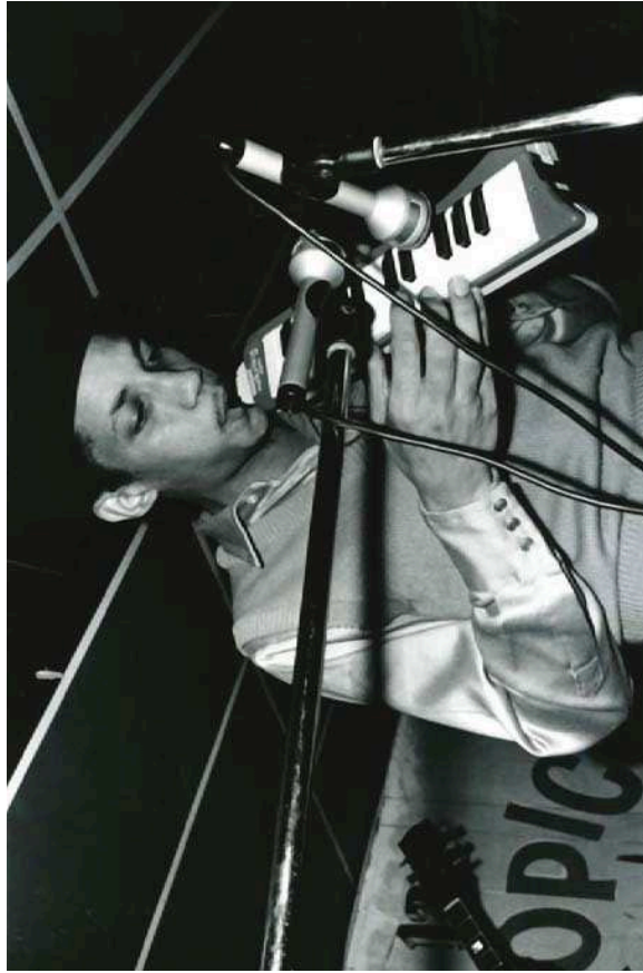
"The picture of Augustus Pablo presides the Rockers shoot. In November of 1974, Pablo had come to play his first-ever US shows. This was opening night at the Tropical One nightclub in Brooklyn."