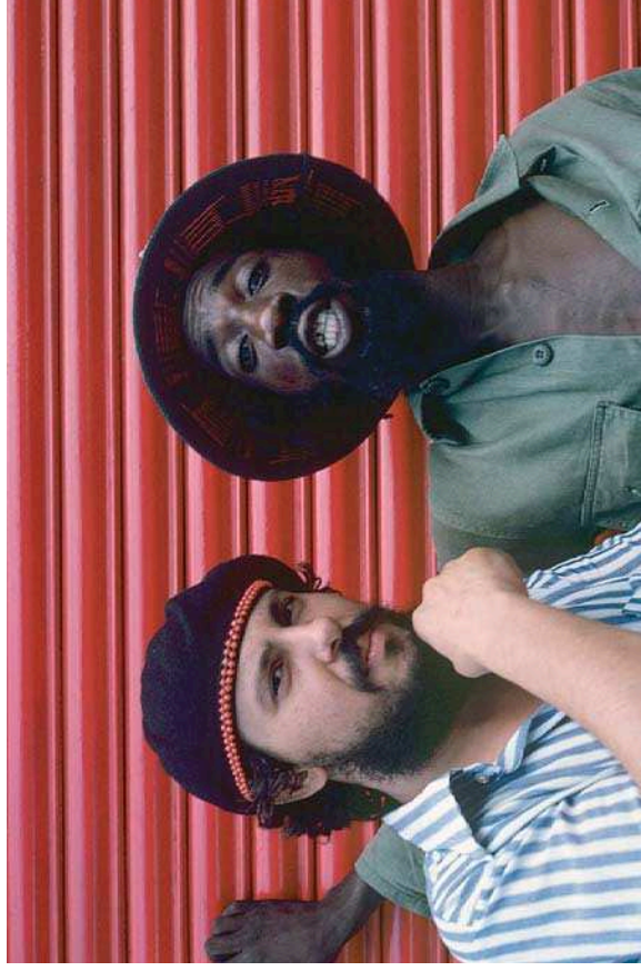
"Me and Leroy 'Hosemouth' Wallace, the legendary pioneering drummer and star of Rockers , modelling in downtown Kingston, 1977."