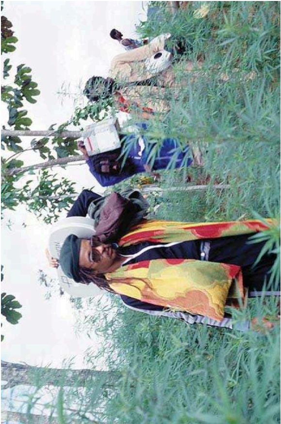
"It was the summer of 1977 and we were shooting Rockers in St. Ann's , on the north side of Jamaica. The actors and the crew carried supplies and equipment through the hills to shoot a scene in a ganja field."