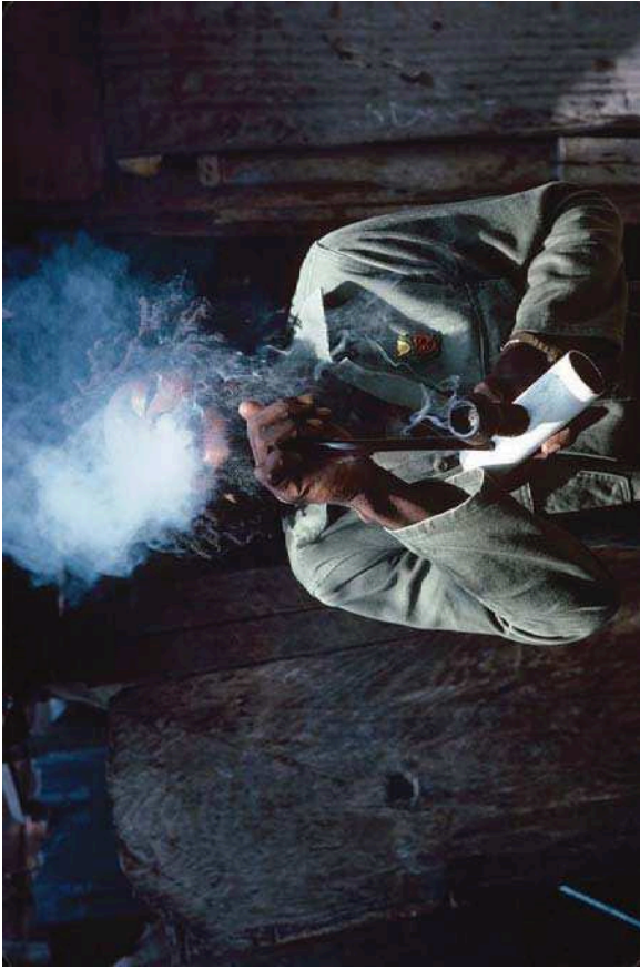
"The weed in Kingston was schweg. Horsemouth compensated by smoking large quantities throughout the day."