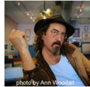
Now Playing on Roots Rad