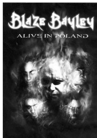
Blaze Bayley's "Alive In Poland" DVD

Metal-head vocalist Blaze Bayley, who fronted the New Wave of British Heavy Metal band (NWOBHM) Wolfsbane as well as doing a five year stint as singer for Iron Maiden, (for the albums Man On The Edge and Futureal) releases his first-ever DVD on the Metal Mind/MVD Video label titled Alive In Poland.