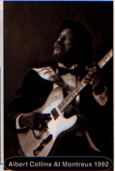
Albert Collins At Montreux 1992