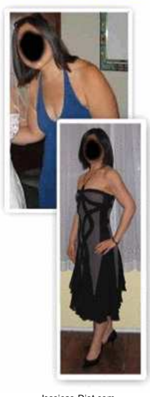
<u>Jessicas-Diet.com</u> <u>Ads by Goooooogle</u>

Site Contents Copyright © 2006 - 2008 Real Movie News, unless used with permission - About Us