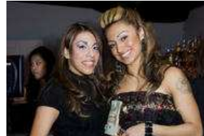
Ladies' Night at Link Lounge More Slideshows >>