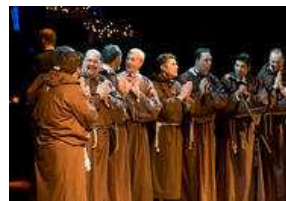
"Homo for the Holidays" with the Gay Men's Chorus of Houston