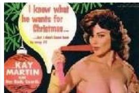
Santa Claus Wants Some Lovin': The 10 Horniest Christmas Songs Ever