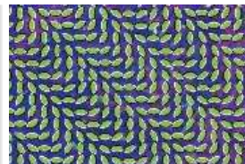
Asshole "Rock" Critics Don't Like Real Rock Music