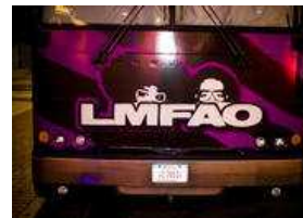
LMFAO and Shwayze at the House of Blues