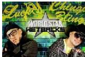
Is Brown the New Black... or the New Wetback?