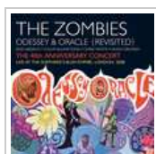
DVD Cover Art

The copyright of the article DVD Review: The Zombies Rise Again in Rock Music is owned by steve fritz . Permission to republish DVD Review: The Zombies Rise Again in print or online must be granted by the author in writing.