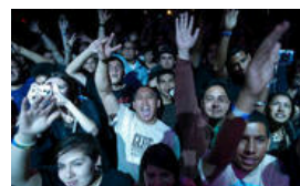
Sage Francis @ The Music Box