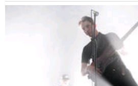
The xx @ The Music Box