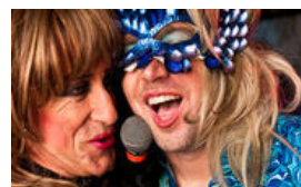
CuriousJosh: Venice Carnevale