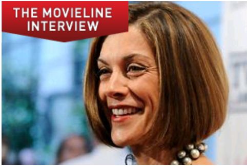
Wendie Malick on Hot in Cleveland and the Power of Betty White