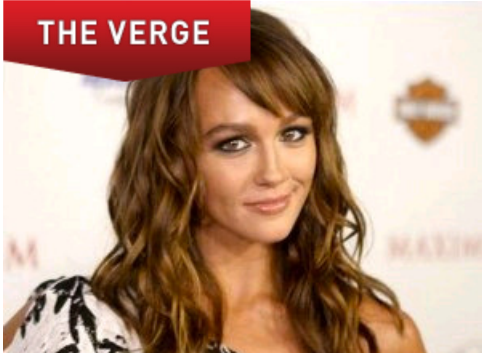
The Verge: Sharni Vinson