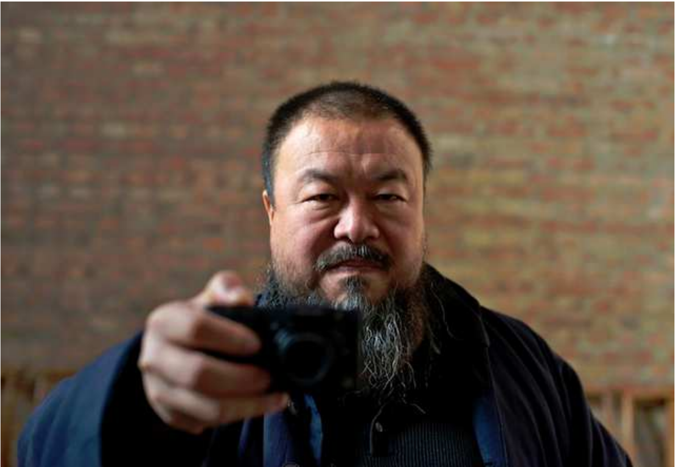
Ai Weiwei: Never Sorry

The extremely talented and controversial Ai Weiwei was thrown into the international consciousness when he spoke out against the Beijing Olympics after designing its centerpiece. The conversations with the artists and studio assistant in the film create a portrait of the Chinese artist that's more intimate than his usual depictions in Western media. And like Ai Weiwei himself, the interviewees are witty, opinionated, and often dissidents in their own right.