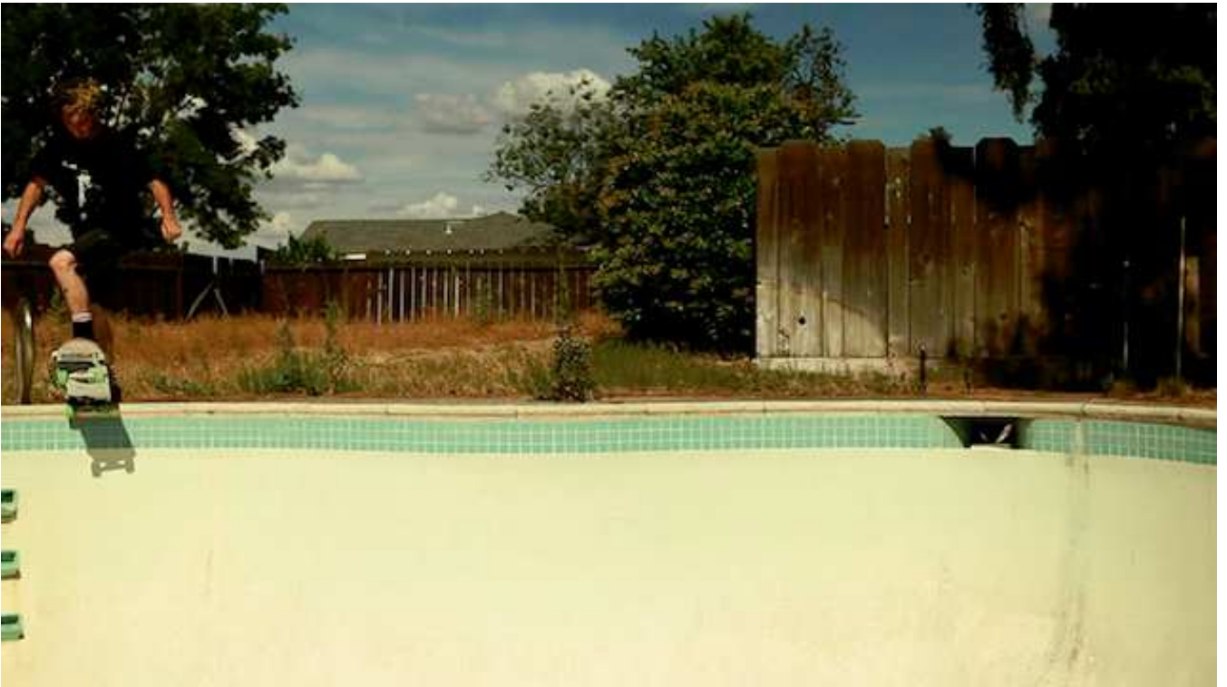
Beautiful Losers