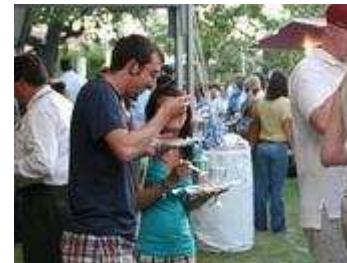
Menu of Menus 2009