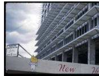
The Humble Oil Building's Humble Beginnings