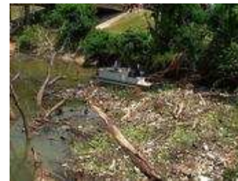
Gigantic Garbage Dams in Buffalo Bayou