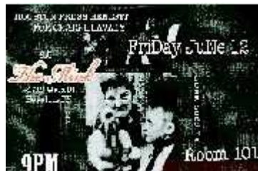
Come Help a Brother Out This Friday