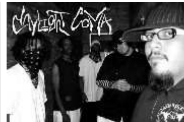
Artist of the Week: Daylight Coma