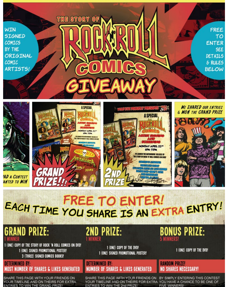
FEATURES: Engaging design built entirely with assets shared by Wild Eye Releasing (producer of The Story of Rock 'n Roll Comics)