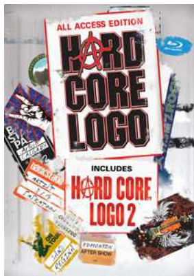
Hard Core Logo: All Access Edition (NR) (Blu-Ray) VSC

Most weeks, I review more DVDs than the Indy can fit into print. You can look for extra write-ups here, on the IndyBlog .