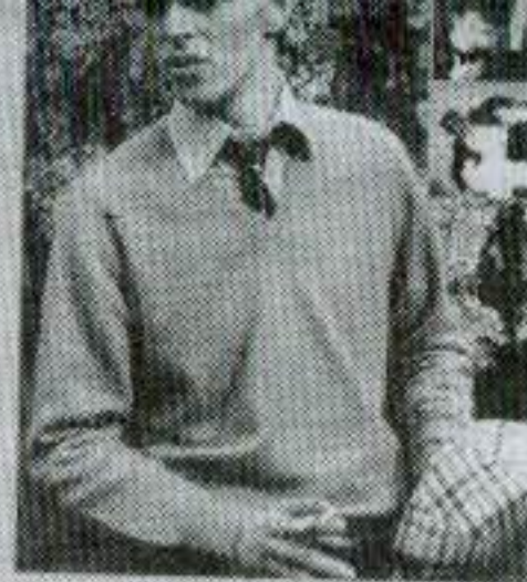
AN INDEPENDENT CRITICAL ANALYSIS

synched up to a slide show of black and white still photos. Nonetheless, it is well done and a perfect backdrop for a Neil Young party if there ever was one.