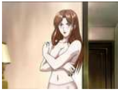
Yugo The Negotiator: Vol.3 - Russia 1- Legacy

About This Site Meet the Team Advertise With Us Contact Us Advertising Policy Privacy Policy