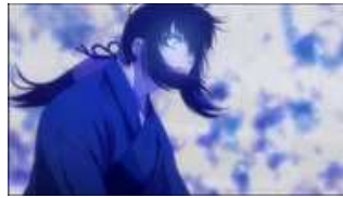
Basilisk: Vol 6