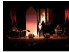
Maddy Prior - The Quest