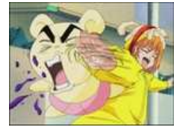
Excel Saga: Complete Collection