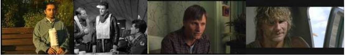
We Know Where You Live: Remix