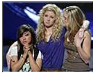
Idol Chatter blog: Who got the boot?