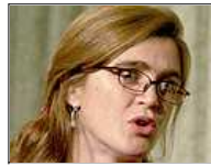
Exclusive interview with Samantha Power