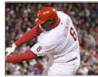
Phillies' offense feeling April chill