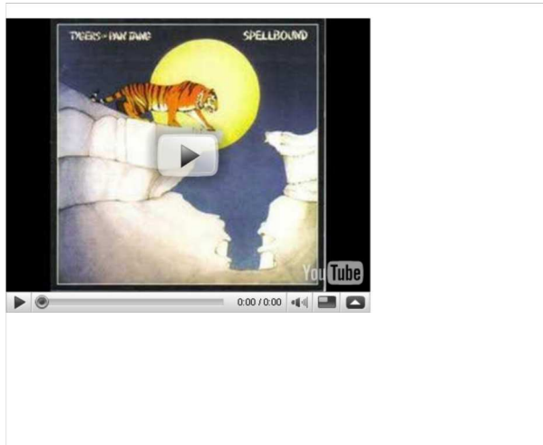
Tygers of Pan Tang - "Gangland"

As for the extra features on the DVD, we do get a few extended interviews, a short clip on the origins of air guitar, which reached positively surreal levels of inanity around 1980 among British teens, and most interestingly, a simply laid-out but surprisingly difficult interactive quiz on NWOBHM history. Iron Maiden and the New Wave of British Heavy Metal might look tacky, right down to the disclaimer "This film is not authorized by the current lineup of Iron Maiden, etc...", but its contents are anything but. If the rich, complex history of heavy metal floats your boat, this DVD is absolutely essential.