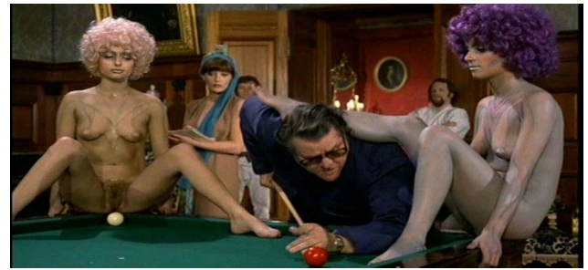
Billiards anyone ??

worked the plot to produce either a spoof like Flesh Gordon (1974) or a copy of a well-known film like Sex World (1978)