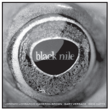
Black Nile Lorenzo Lombardo (MVD Audio)