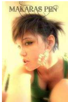
MAKARAS PEN Makaras Pen

Ever the optimistic song-stylists, Too Late For Roses new cd, "Debut" blends elements of U2, REM, Mazzy Star & Ryan Adams...you know, when you read back the list of artists I just named...I use them in reference to elements I feel Too Late For Roses have in common with those aforementioned artists...in reality, Too Late For Roses play post modern rock that's low on aggression & high on rhythm & insightful lyrics. The packaging is artfully done & it matches the mellow vibes transcended throughout this disc. Cool record, mellow & hypnotic & "So Gone" is my personal favorite probably because it's got the heaviest vibe on this record!