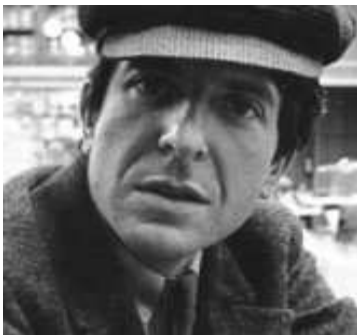
On This Day In 1934: Leonard Cohen Is Born