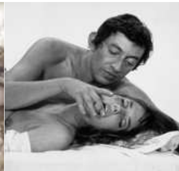
John and Yoko or Serge and Charlotte?