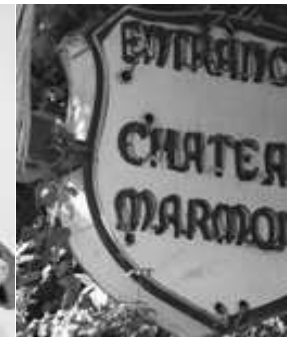
Will Self: Walking to Hollywood