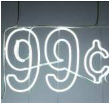
Artists Get Textual