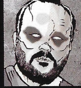
by Jay Kay

I had the disturbing pleasure to experience this film at Slaughter in Syracuse. Witnessing the visceral and unhinged power on the screen really blew me away! The saturating feel of the colors giving a surreal canvas for the over-the-top sexuality, violence, and death made me think back to early works by Hooper and Craven. While the film is extremely underground, raw and low budget, it features some distinctive and well-crafted villains, as well as some strong female characters. The film lacks in development on several fronts but is laced with emotion that is amplified with the '80s reflective score. Hats off to Woods for this despicable treat, perfect for the darker side of All Hallows' Eve. 🔥