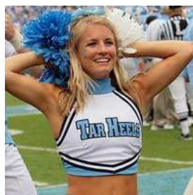
This Cheerleader Would Be So Embarrassed If She Saw This!