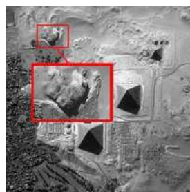
The Most Blood-Chilling Image Ever Found On Google Earth