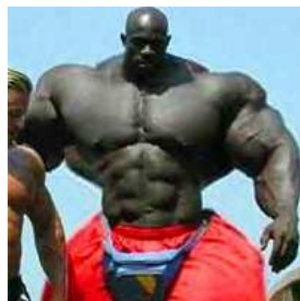
Incredible Hulk Comes From Africa! (Video)