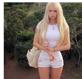
Oh My... You Should See Her Jaw-Dropping Pics!