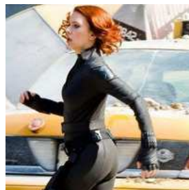
1000 Viewers Gaped When They Noticed This Mistake!