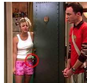
Just Take A Closer Look At Kaley Cuoco's...