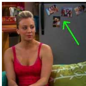
You've Never Seen a Fail Like This...