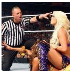
In 5 Seconds You'll See Why Referee Had To Stop This!