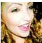
Hippy Woman - LA