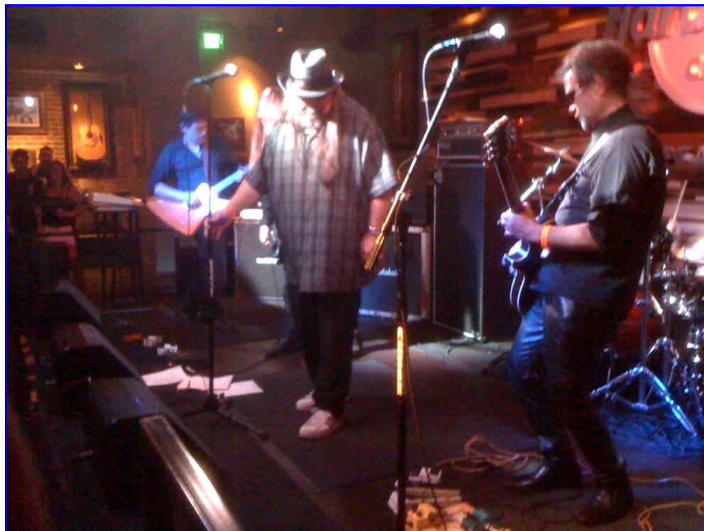
All Hail The Crown.