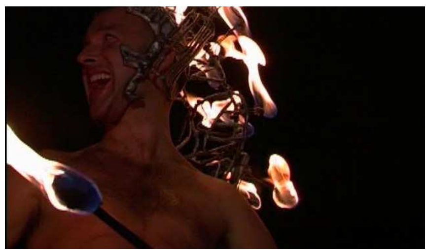
Official GothKill deluxe marshmallow roaster, yours for only two easy payments of $29.95!

boring and the effects less than believable. The lines are doubly so. The movie wants to be more clever than it is, but it becomes just a chore; the massacre scene was the best part because hey, at least people weren't saying anything outside of 'aaah' and 'oh no!'