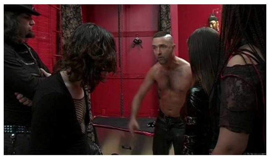
"Shirts? Never heard of em."

kills everyone in boring, unimaginative ways before skipping back to the underworld to torment said NYC Goth Clubbers. Oh, there's also some girl who doesn't get killed because she's a virgin. It's more or less a true story, save for the virgin part, those don't exist in New York. (Oh god, how I have looked...)