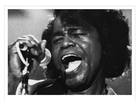
One of the best to ever step on the stage...